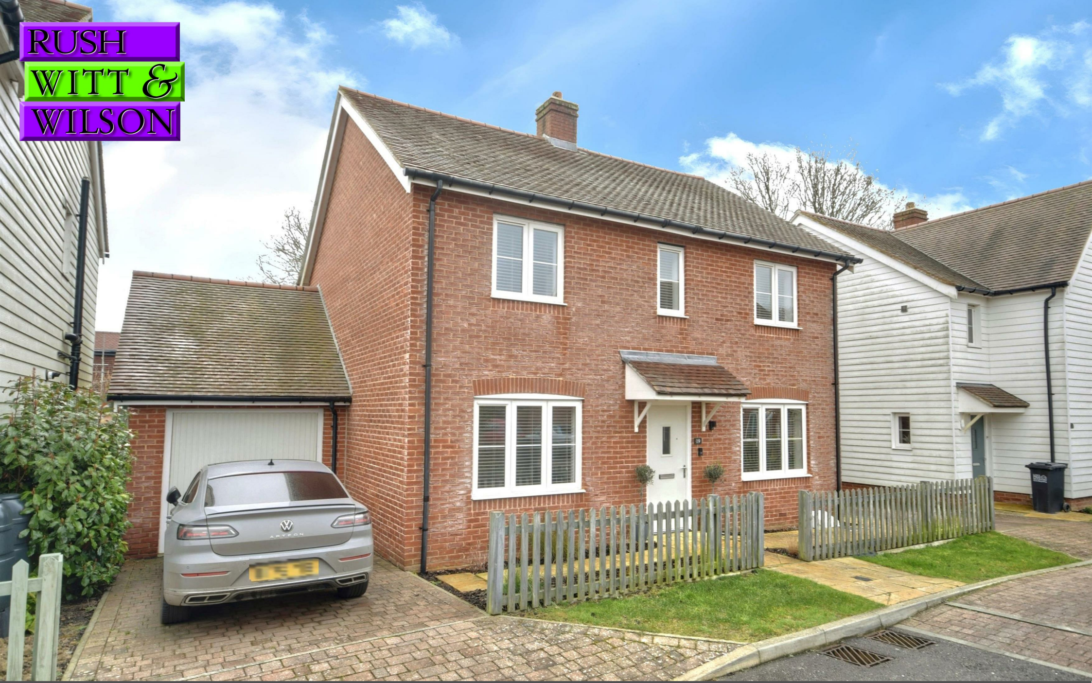
19 Donsmead Drive, Northiam, East Sussex, TN31 6EQ. £535,000 OIEO Freehold